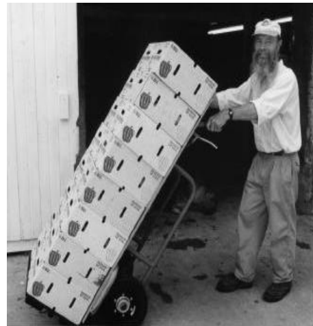
Fig.4. Narrow Pallet System

Worker rolling a stack of boxes with a hand pallet truck. As in other industries, but particularly in agriculture, effective ergonomic interventions must be developed and implemented using a team approach and as a part of comprehensive risk management approach.