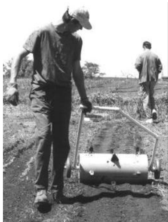
Fig.1. A Rolling Dibble Marker

Historically, farmers throughout the world have been implementing “ergonomic” solutions to improve productivity and increase comfort. A good example include the introduction of threshers to replace manual threshing of rice paddy, wheat and other grains in farms in India, China, Sri Lanka, Thailand, Philippines, and other countries in Southeast Asia and Africa [11,12]