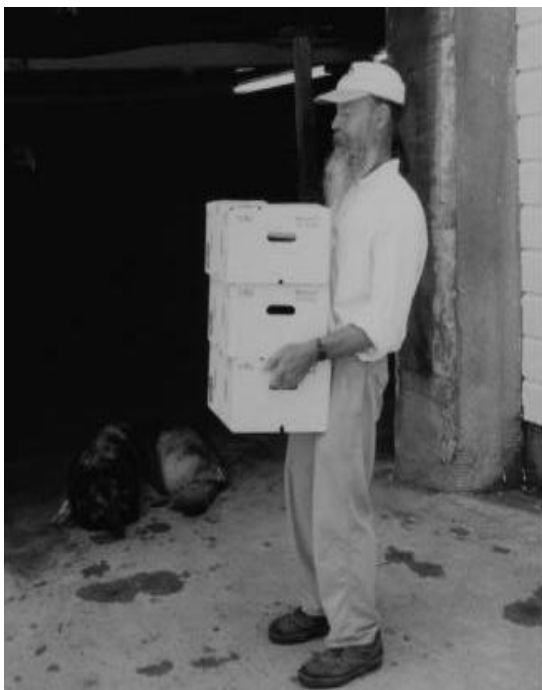
Fig.3. Standard Carrying System

Many tools have also been developed to reduce the amount of bending required from the agricultural carrying heavy boxes by hand is strenuous and very awkward.