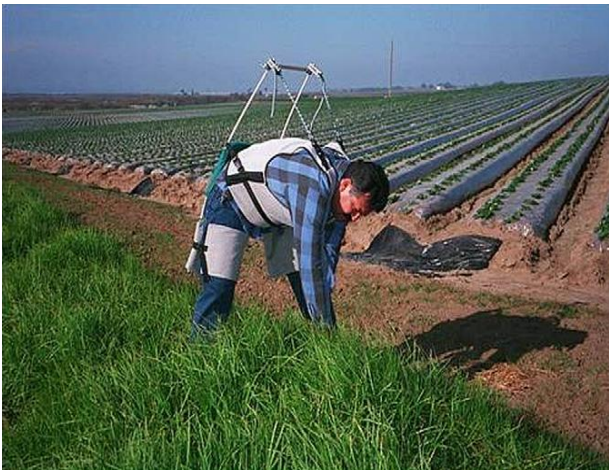
Fig.2. Personal load transfer device worn by a farm worker (ErgoAg, Aptos, CA).

Another type of worker fig 2 aid that holds promise in reducing lower back disorders among agricultural workers is the “load transfer device”.The device transfers a portion of the weight and moment of the upper body from the low back tissues to the hips and or legs.