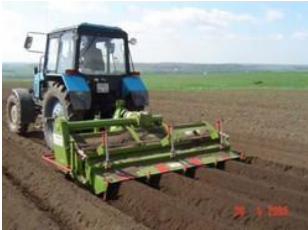
Fig.2. Ditch machine, used after potato planting

The radius is of most concern to the machine operator in irregular or contoured fields.