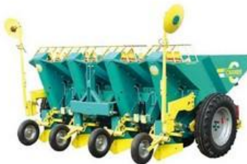
Fig. 1. Machine for potato planting on 4 rows

Combines, potato harvesters and similar machines that separate desired material from undesirable material need a special capacity comparison term. Rather than a report on the weight of material harvested, the weight of material handled is the proper capacity measure. Time efficiency is a percentage reporting the ratio of the time a machine is effectively operating to the total time the machine