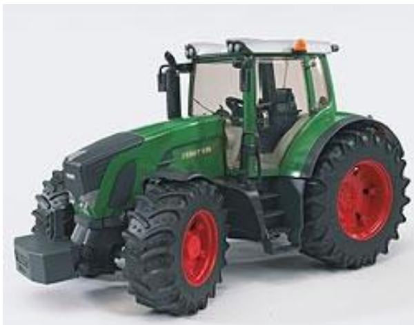
Fig.3. Tractor used for different operations for planting and processing potatoes